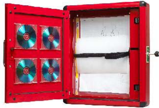
Premises Information Box with CD ROM holders